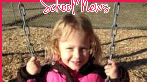
New Pre-K Playground