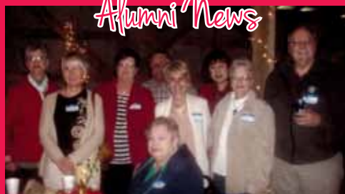
Class of 1964 celebrates 50th reunion