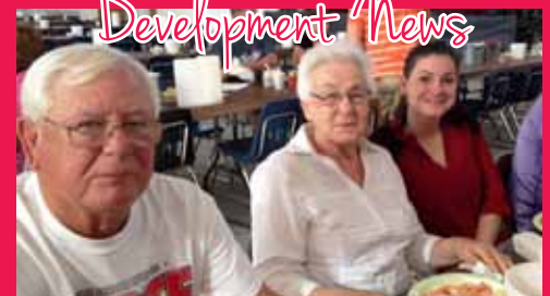
Cajun Fete Held