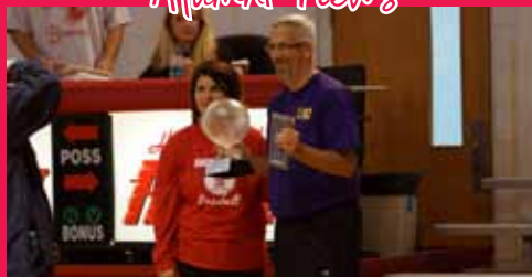
Sacred Heart Hosts the 2nd Annual Alumni Rivalry Game with St. Joe