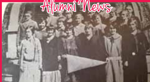
SH Alumni Facebook Page Launched, pictured Class of 1925