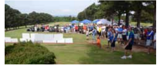
Golfers getting ready to hit the course.

In six years, the tournament has donated over $110,000 to Sacred Heart School and Endowment Fund. These gifts have been instrumental in the recent capital improvement projects, including the lab, elementary, and high school renovations, the addition of the Rebel Plaza, and recent technology and security updates.