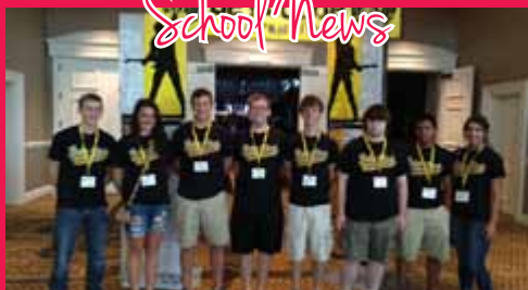
SH at National Beta Convention