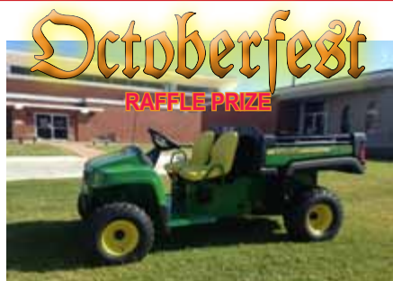
2015 John Deere Gator TX 4x2, 2-wheel drive