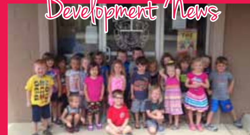
Campaign Kickoff Set for October 17