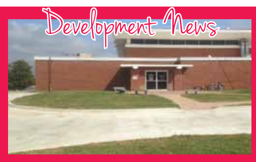
Campaign Kickoff September 27th