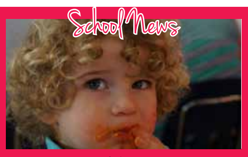
Successful SH Bazaa