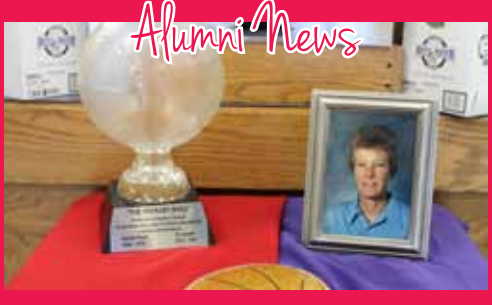
Alumni Game Set for November 16th