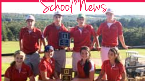
High School Golf Teams Take District Awards