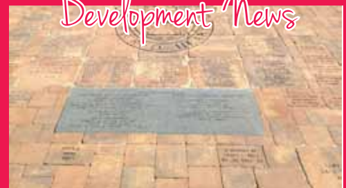
Find your paver