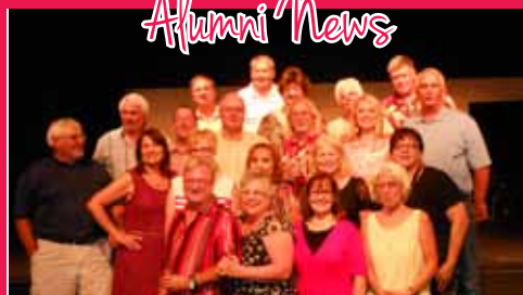
1973 Class reunion